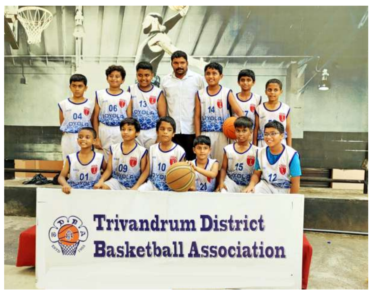
Second Position in Trivandrum District Basketball League