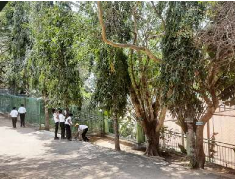
Now that all trees and plants on the campus are labelled, students follow up the effort by taking down notes