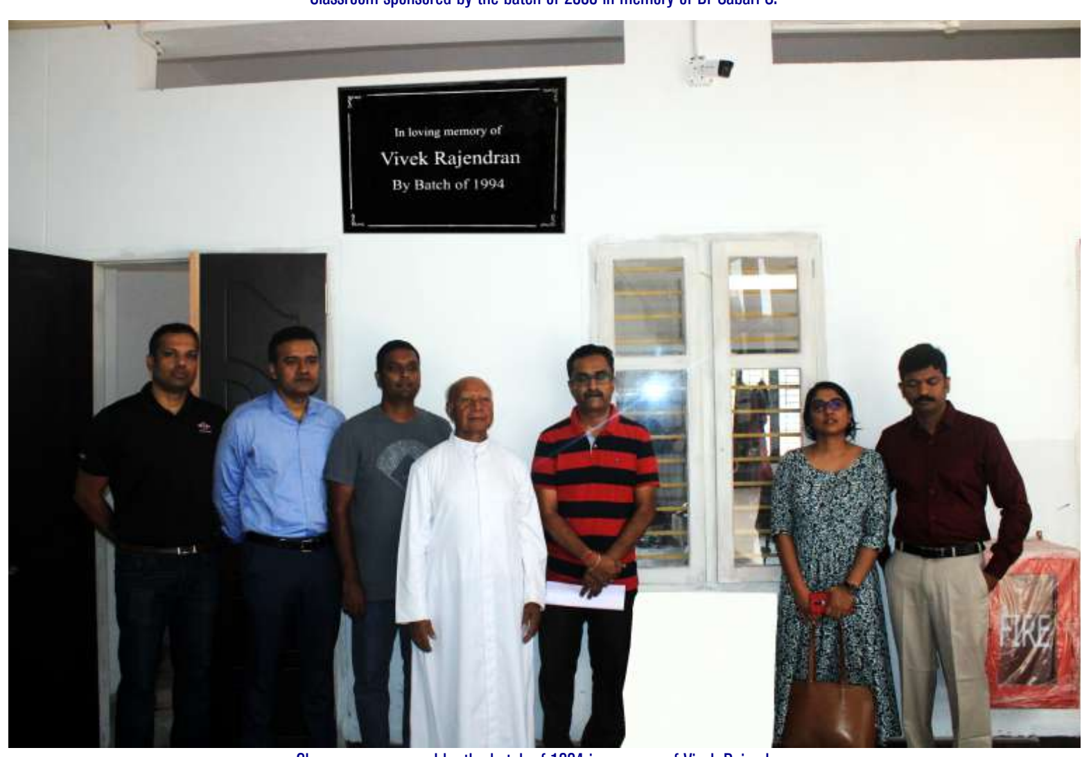
Classroom sponsored by the batch of 1994 in memory of Vivek Rajendran