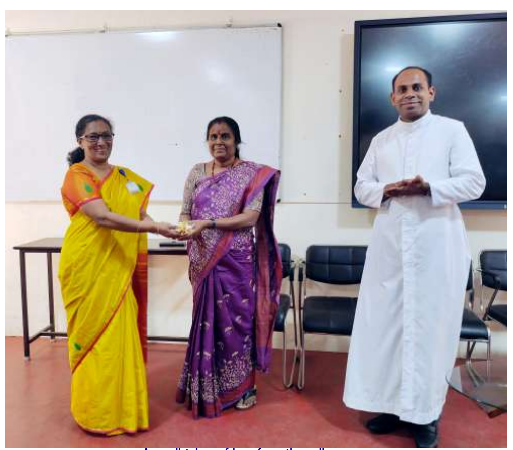
A small token of love from the colleagues

God has given us the freedom to choose friends who will be with us for ever. Parents love us as