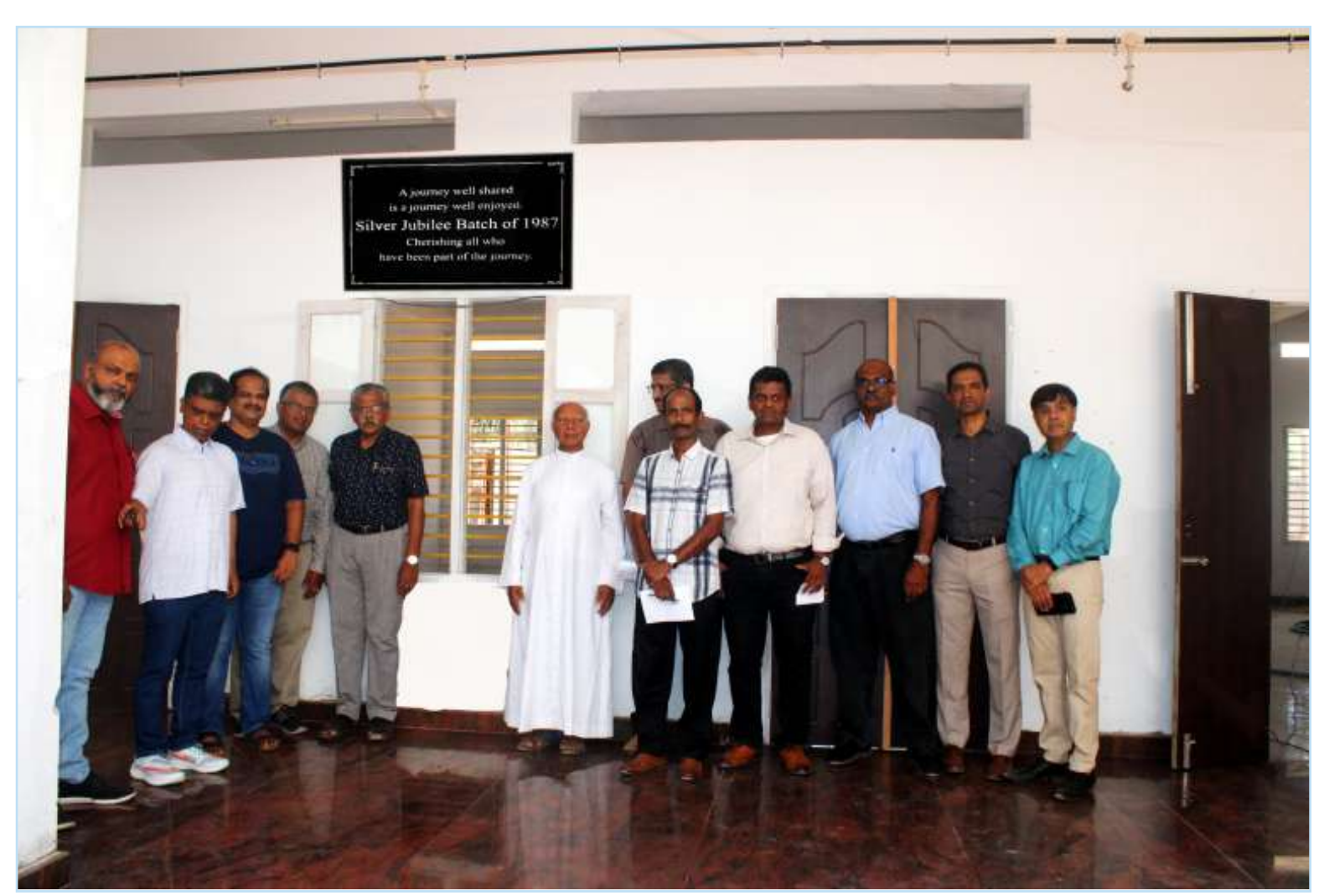
Classroom sponsored by the Silver Jubilee batch of 1987, cherishing all who have been part of the journey