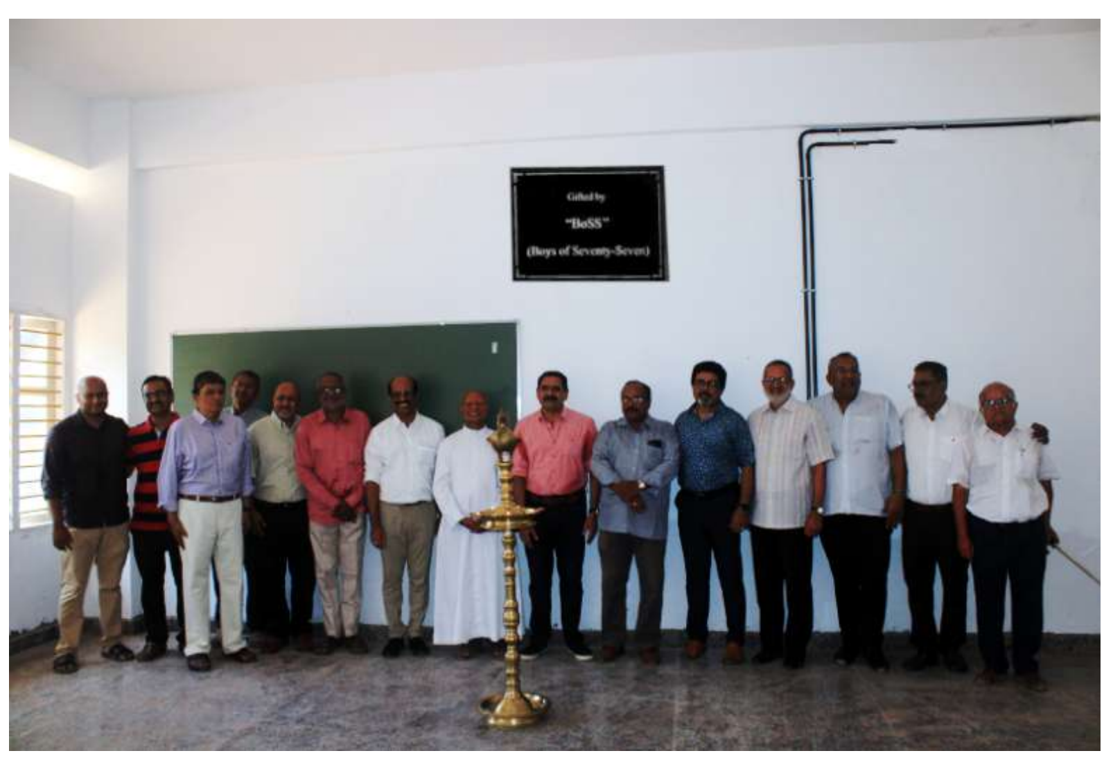
Classroom sponsored by BoSS (Boys of Seventy-Seven)